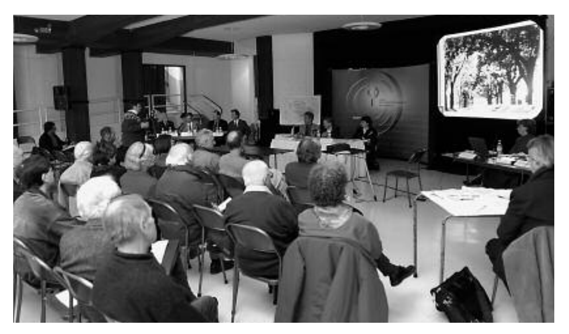
Saint-Laurent, Rivière-des-Prairies-Pointe-aux-Trembles-Montréal-Est and Lachine, and one in each of the following boroughs: Kirkland, Pierrefonds-Senneville, Plateau-Mont-Royal and Dollard-Des Ormeaux-Roxboro.

The Office has established a protocol (please see Appendix V) with the Conseil du Patrimoine de Montréal for holding joint consultation meetings on the projects of the Cimetière Notre-Dame-des-Neiges and the Oratoire Saint-Joseph du mont Royal, in order to facilitate public participation and avoid unnecessary duplications and delays.