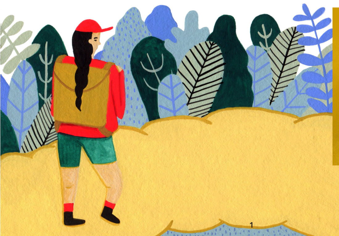
It's all about timing

Public consultations offer a glimpse into a project at a certain point in time, but a lot of changes can happen after a consultation is held. This is why it is important to follow up afterwards and understand how a project evolves. By allowing residents to invest in a project's development, residents are given the opportunity to help improve the quality of their surroundings.