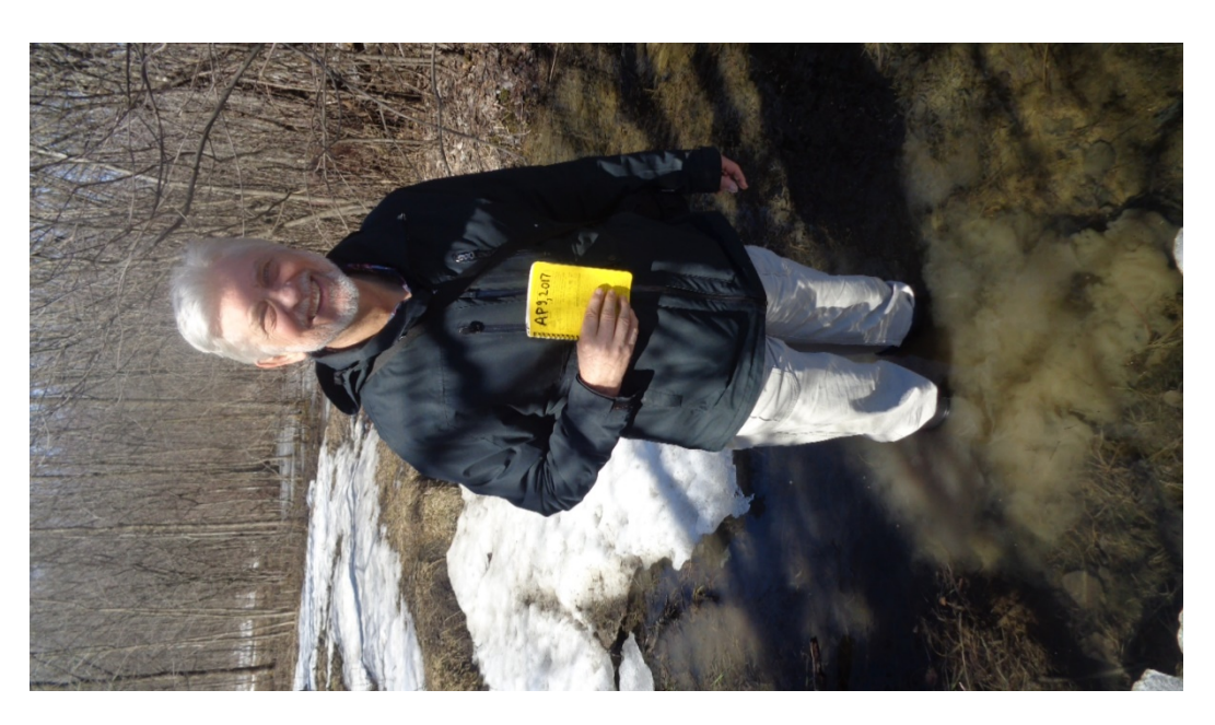
4: In the development area, April 19, 2017