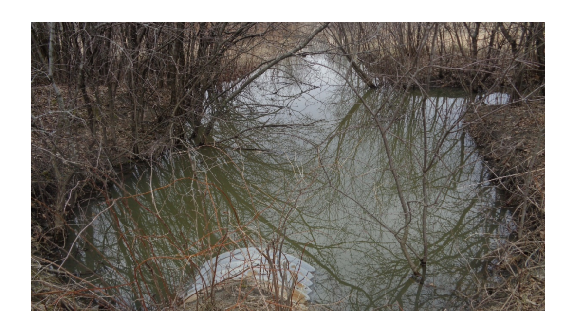
April 27, 2017 Comments on a proposed "development" plan for the