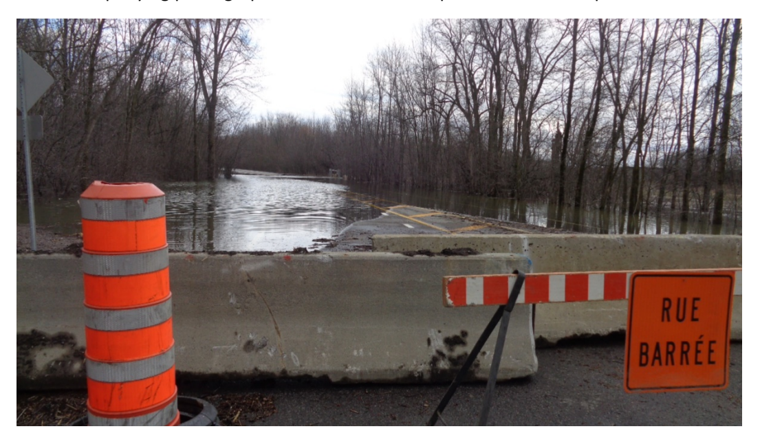
1: As of April 25<sup>th</sup>, 2017, the Anse-à-l'Orme Road had been closed for three days due to flooding (above).

The accompanying photographs show what certain parts of the development area looked like recently: