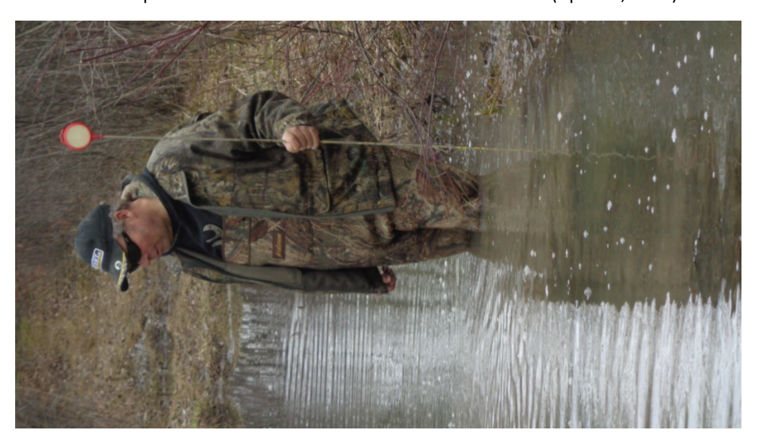
3: In the development area, April 21, 2017