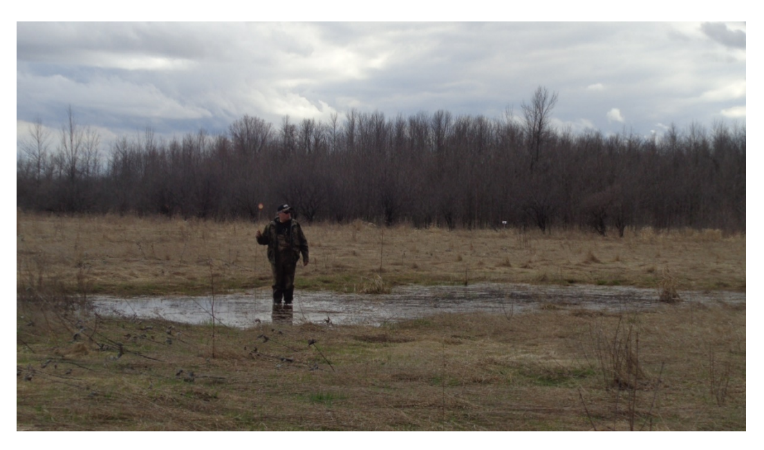
2: In the development area about 800 m east of Rivière-à-l'Orme (April 21, 2017)