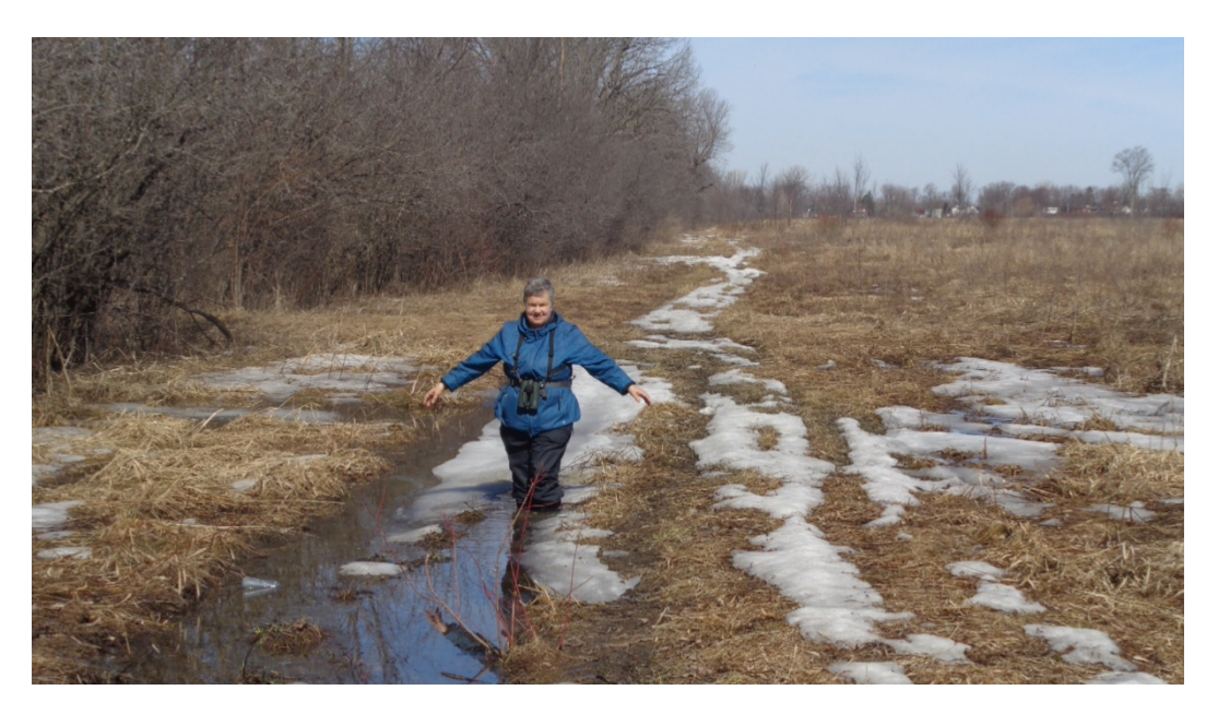
5: In the development area, April 19, 2017

The development proposal would destroy several wetlands, as the area is sprinkled liberally with them. It would "protect" two, the Marais Lauzon and the Marais 90 . This "protection" may not be adequate to ensure the vigour of the marshes. François Morneau ( Audit écologique (inventaire) de l'avifaune Projet d'aménagement des marais Lauzon et 90 , December 2015; Contrat 15-1509, Ville de Montréal) noted