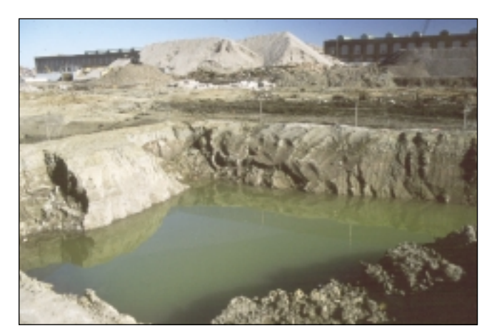
Angus Shops, Montréal, Quebec: Before site cleanup, 1998

The approach seeks to provide greater assurance for all parties—community residents, industry, investors and local governments—that appropriate standards are being applied, that the cleanup is being carried out properly and that the environment is protected.