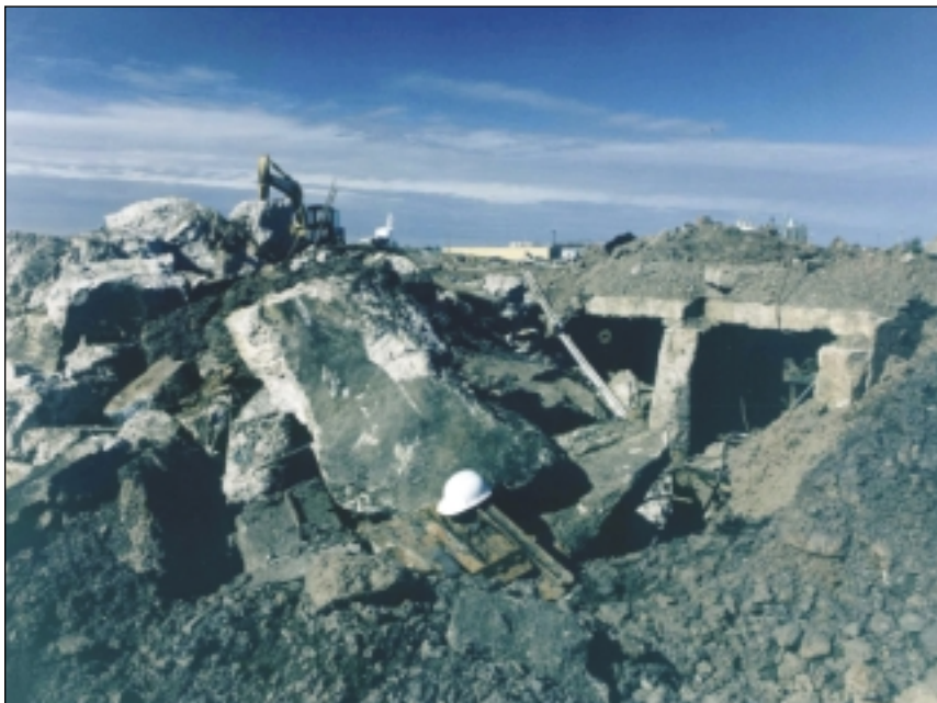
Cleanup at the Moncton Shops site, Moncton, New Brunswick, 1997

Federal funding should act as an incentive for provincial action. Following an initial period of perhaps five years, federal funding could be offered on a preferential basis to encourage participating provinces to continue progress on brownfield redevelopment initiatives (though assistance should not automatically be withheld from provinces that have not acted to facilitate brownfield redevelopment).