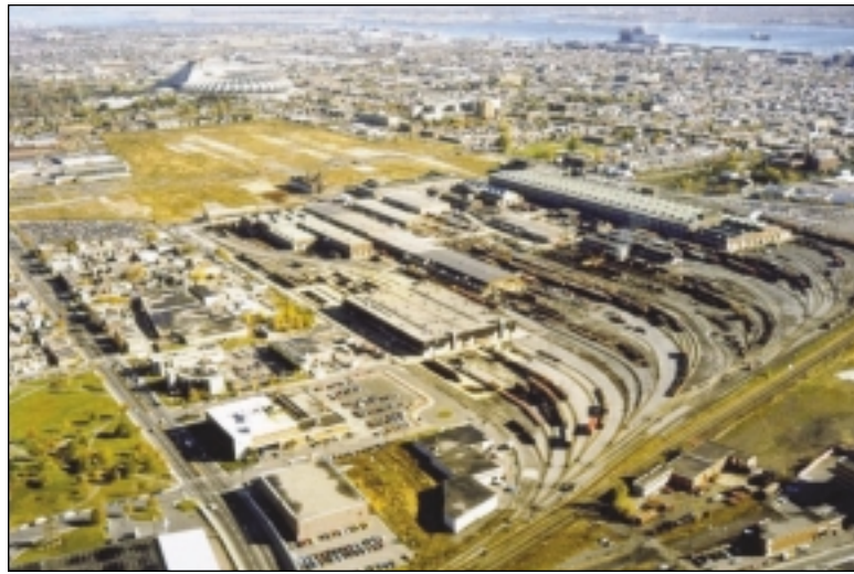
Angus Shops, Montréal, Quebec : half brownfield, half industrial complex, 1978

Brownfield redevelopment has not been a high-profile issue in many communities. There is a general lack of awareness-among all levels of government, the private sector and at the community level-of the challenges and opportunities presented by brownfield redevelopment.