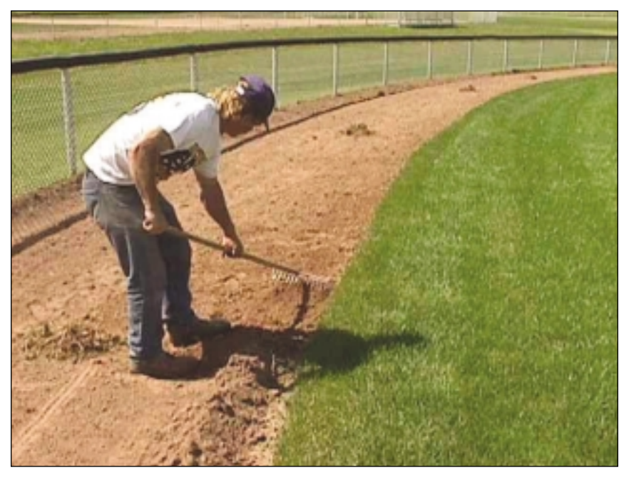
Preparation of the new sports fields at the former Moncton Shops site, 2001