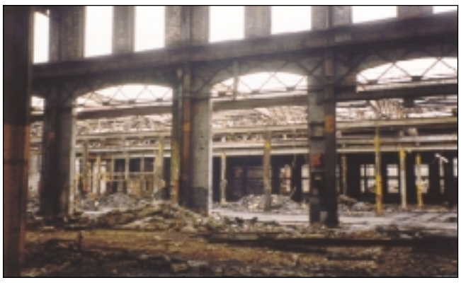
Old foundry buildings before redevelopment, Spencer Creek Village, Dundas, Ontario, 1998