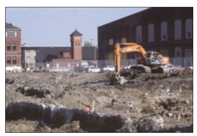
Cleanup at Angus Shops site, 1998