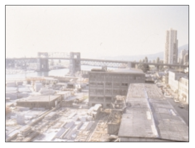
False Creek, Vancouver, B.C., before redevelopment, 1950s

(For more information on the study, see Annex 3.)