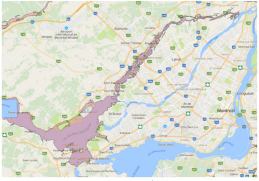
Flood maps for the Lake of Two Mountains and the Mille Îles River were the only ones made with new data in 2006. For the Rivière des Prairies, the flood maps were made in the 80s and are no longer fit for planning.

There are no flood maps for most of Montreal's shoreline.